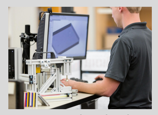
ATLAS Controls Engineering

Hartfiel Automation's Value-Add team provide much more than just assembly and light manufacturing support - they bring the experience to quickly and efficiently design, test, and deliver the best solution for your assets.